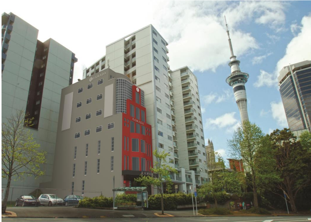
RAMADA SUITES FEDERAL STREET, AUCKLAND